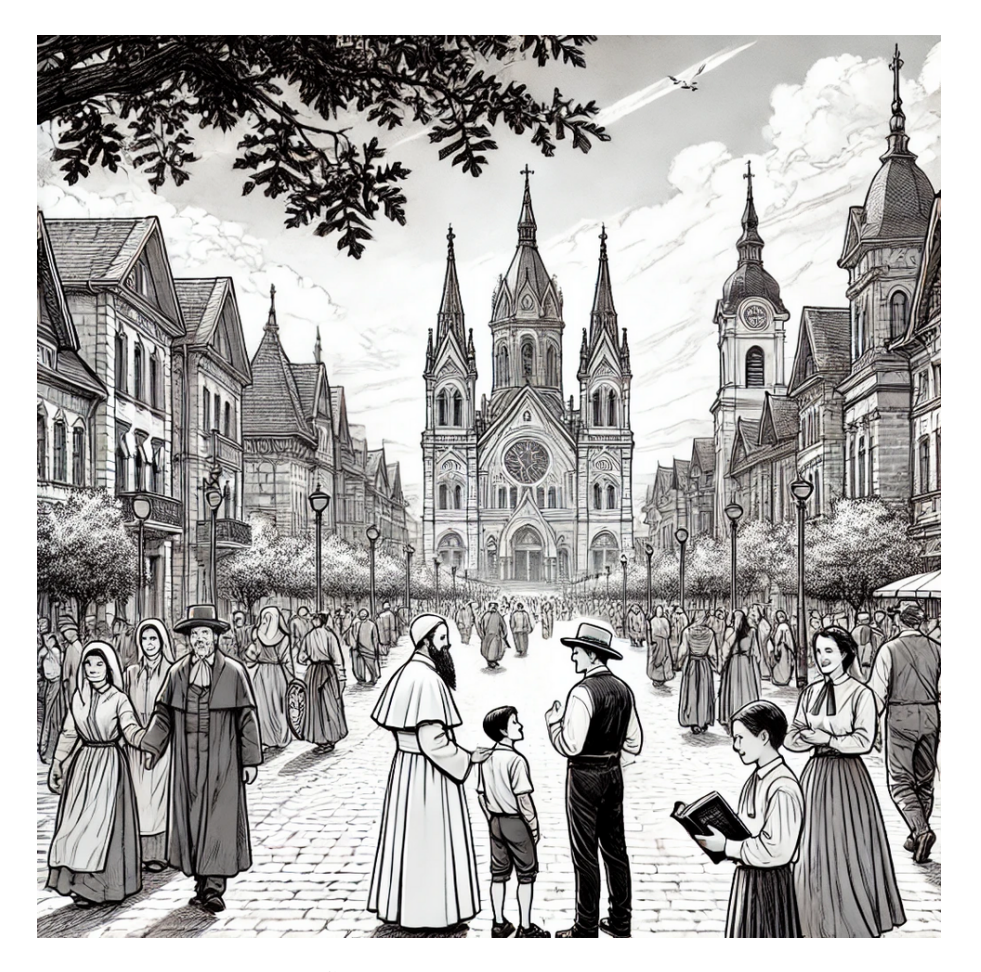
Figure 2: Chapter 2: Encountering the Romans Road

May we, like the Russian olive trees, stand as symbols of resilience and the life-giving power of compassion that reaches beyond ourselves to nourish the world.